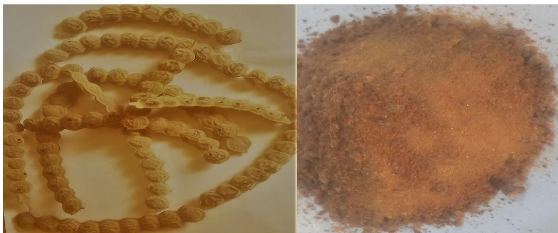
Figure 1: (a.) A nilotica pod (b.) A. nilotica pod extract

The aqueous extracts of Acacia nilotica Pod yielded