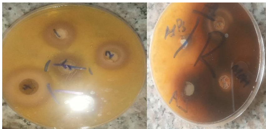
Figure 4: Sample Lates

47 revealed the antifungal efficacy of ethanolic A. nilotica pod extract as it causes weak effective growth inhibition by between 4.05 and 37.48% as the concentrations increased from 100 to 1000 ppm while [46], showed how hexane stem bark extract of the same plant inhibits mycelial growth by 46% ( Fusarium oxysporum ), 58% ( Rhizoctonia solani ) and 52% ( Alternaria brassicae ).