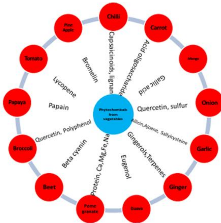
Figure-2: Different phytochemicals derived from fruits and vegetables used as nutraceutical.