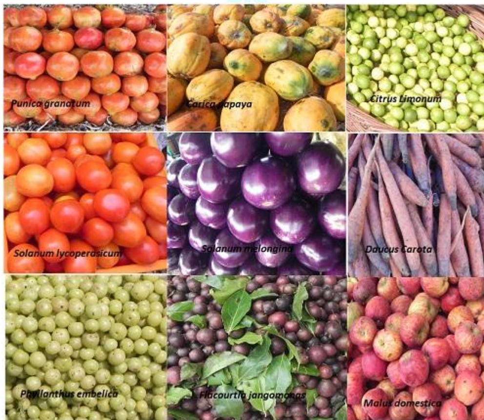
Figure-3: Photographs of different colours of commonly available fruits and vegetables