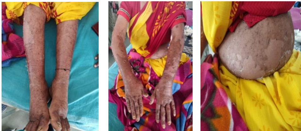
Figures 1, 2 and 3: Patchy skin eruptive scales all over the body.

palms and soles, facial puffiness, erythema in genitalia and oral candidiasis. Dermatological impression concluded with DRESS secondary to Anti-Tubercular Therapy.