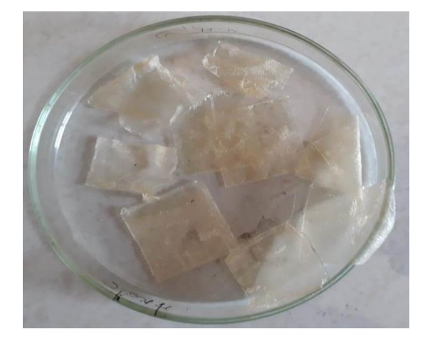
Figure 2: Prepared fast dissolving oral film