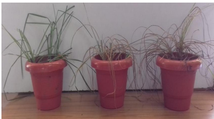
Fig. 1. Effect (infected plants) of colletotrichum gloeosporioides , on Echinochloa crus - gali

The present data suggest that Colletotrichum gloeosporioides was approved as highly aggressive towards control of Barnyard grass and has certain characteristics suggested by various workers. Barnyard grass is one of most noxious limiting factors in rice production in the world. Colletotrichum gloeosporioides was highly pathogenic on this weed and very safe to rice. The results of this study indicated that this strain could be a potential mycoherbicide to control barnyard grass in the future. There are several biological and environmental limitations which obstruct the efficacy of a biocontrol agent. In the present days, advances in adjuvants formulation and delivery system have been used to overcome some of these limitations and improve the efficacy of a bio-control agent (Boyette et al. , 1996).