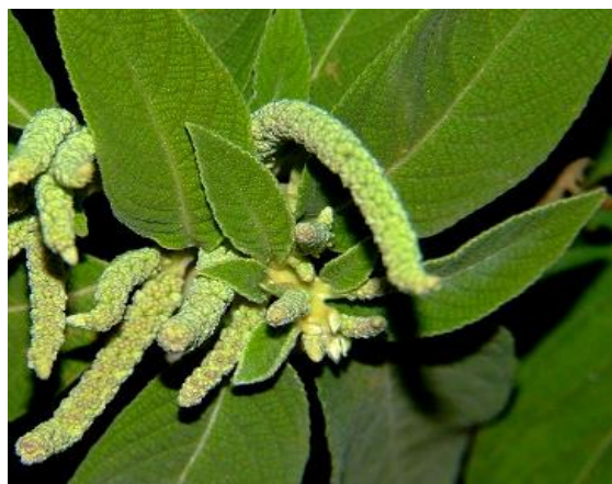
Fig.1. Leaf with flower

antimicrobial 8 , cardioprotective 10 and anti-fertility 11 activities. Furthermore, confined to the present work, various parts of the plant such as roots, leaves and stem (in the form of decoction and dry powder) are being extensively used for the treatment of epilepsy by various folk medicine practicing communities such as nomadic Gujjars, Tharu and Bhoja in sub- Himalayan regions of India, from many decades and even now 12 .