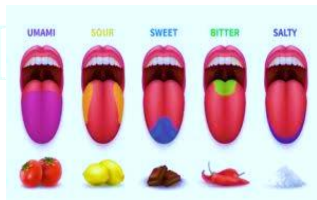
Fig.1. Zones of taste sensations on the tongue.

Five taste sensations are sweetness, salty, sour, bitterness, and umami are showed in Fig 1. Umami Scientific experiments have demonstrated that these five tastes exist and are distinct from one another.