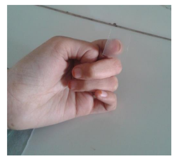
Figure 1. Fast dissolving oral films of CTZ

Weight variation varies from 42.03\pm0.13 to 52.05\pm0.42 mg, as the polymer awareness increases the thickness, folding persistence and disintegration time of the movie additionally increases. The formulation F3 shows 33 Sec (disintegration time).