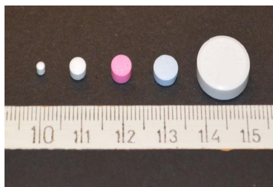
Fig. 3: Comparison of mini tablet of 2 mm and 4 mm with comparison of conventional tablet 15 .