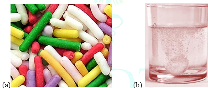
Fig. 2: (a) Flavaored Sprinkles (b) Effervescent tabs in water.

Medicated Flavored sprinkles are one of the non-conventional and new dosage forms that prove to be good alternative of oral dosage forms. Powdered medicated sprinkles are added with compatible food items prepared in household. It proves to be a successful method for delivering the required therapeutic effect of drug 18 . Various pros and cons of unconventional dosage form are summarized in Table 3.