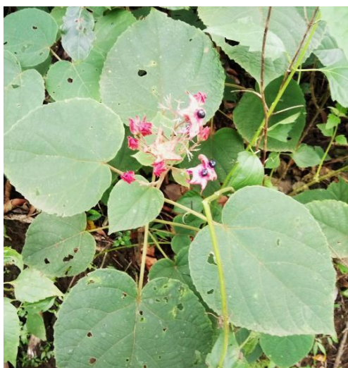
Figure 1: C. infortunatum

C. infortunatum (Figure 1) is a large villous shrub (reaching a height of up to 2.5m) with quadrangular branches. Leaves opposite, broadly ovate, 25x20cm, shortly acuminate at apex, cordate at base, denticulate or serrate, pubescent above, pubescent or tomentose beneath.